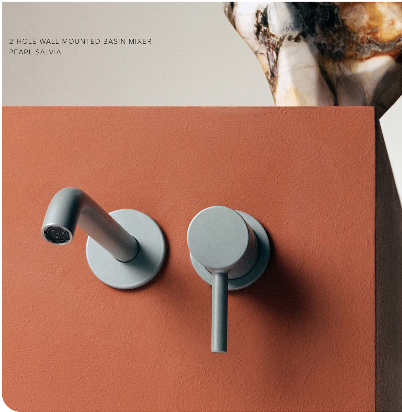
2 HOLE WALL MOUNTED BASIN MIXER PEARL SALVIA